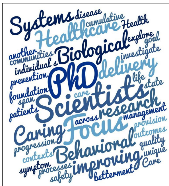
Figure 2. PhD Foci Word Cloud

These three foci emphasize both inculcation and generation of substantive knowledge in nursing. Nationally recognized content experts comprise the CU Nursing faculty and teach courses in each focal area. Each student builds an area of concentration, including an in-depth study in the selected focal area. Students' plans of study are supported by coursework within the discipline of nursing and in other disciplines. Students work closely with their Academic/Major Advisor and Advisory Committee in choosing elective courses. Electives are to be supportive of the projected Dissertation research, and one elective must be taken external to CU Nursing. Electives taken external to CU Nursing support Dissertation research by enhancing relationships with potential Committee members and refining the students' theoretical, content, and/or methodological perspectives. Nursing education courses, while important for future career possibilities, are not part of the plan of study and do not count as an elective.